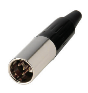
SilverBullets use industry standard, locking mini 4-pin XLR's for power. OA Power-Tap adapter is also available