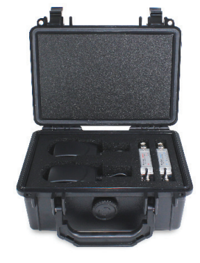
The case, power supplies and international AC plug adapters are all included

252 Indian Head Rd Kings Park, NY 11754 1-877-685-8439 / +1-516-671-7278 sales@multidyne.com www.multidyne.com